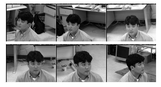
Figure 4. Face images obtained from omniview camera. (6 images are shown here out of 50 that were available).

characteristics, and relation to other non-verbal behavior. Development of robust methods of facial expression analysis requires access to databases that adequately sample from this problem space. The CMU-Pittsburgh AU-Coded Facial Expression Image Database provides a valuable test-bed with which multiple approaches to facial expression analysis may be tested. In current and new work, we will further increase the generalizability of this database.